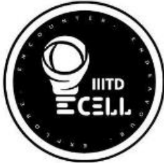
Indraprastha Institute of Information Technology, Delhi