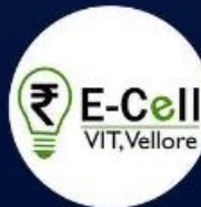
Vellore Institute of Technology (VIT), Vellore