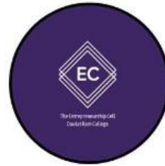
Daulat Ram College, University of Delhi